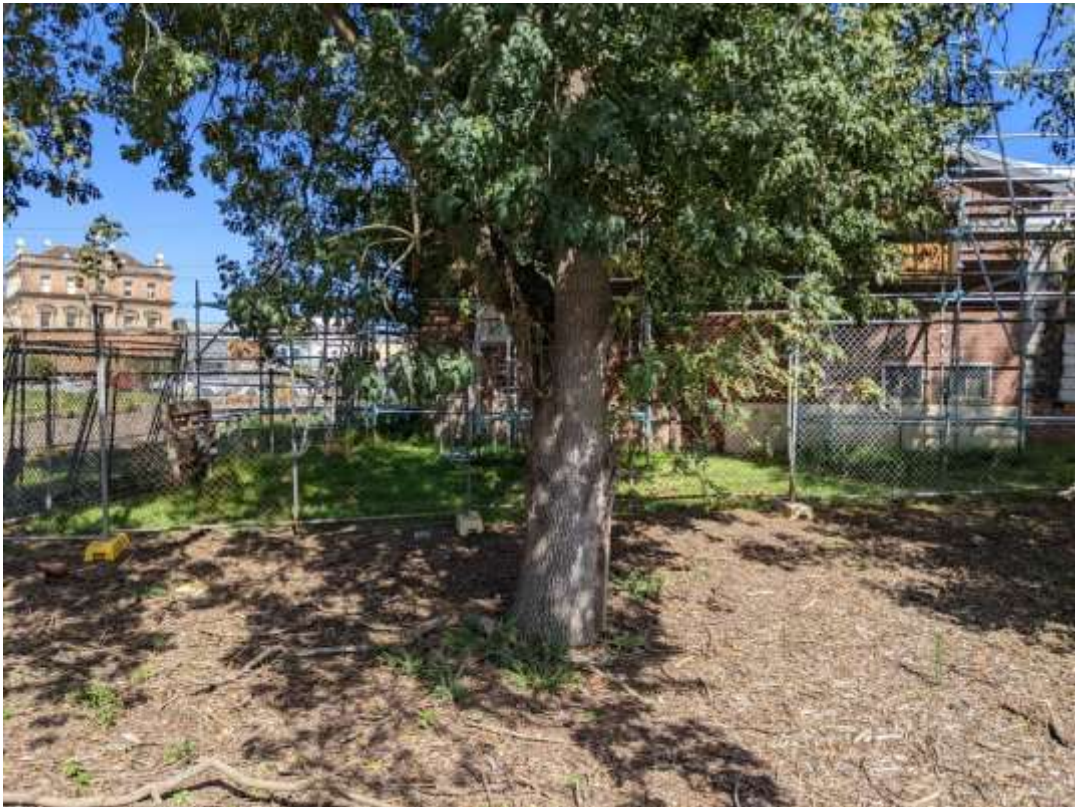
Photograph 14 – Tree 6