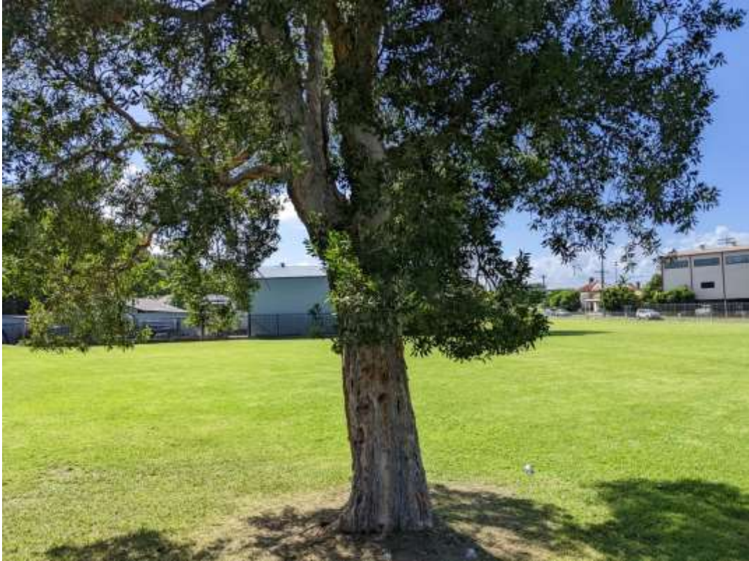
Photograph 23 – Tree 12