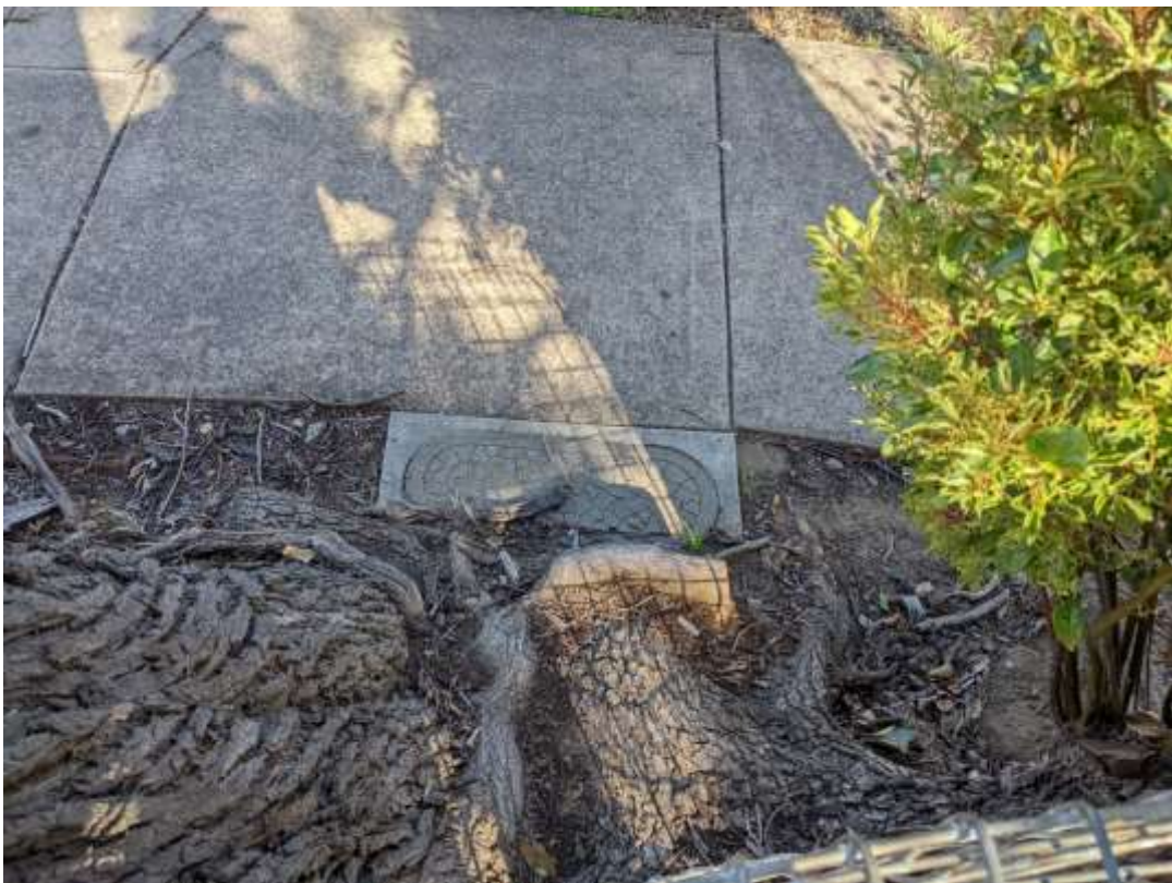
Photograph 10 – Tree 3 and comms pit