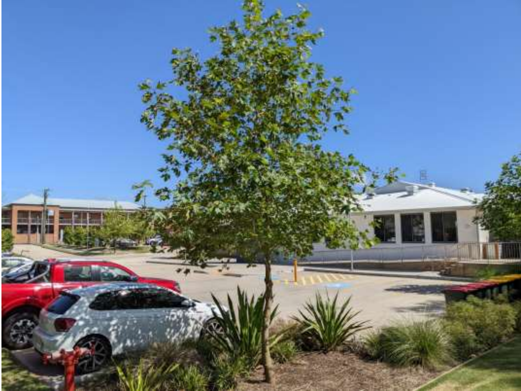
Photograph 37 – Tree 21