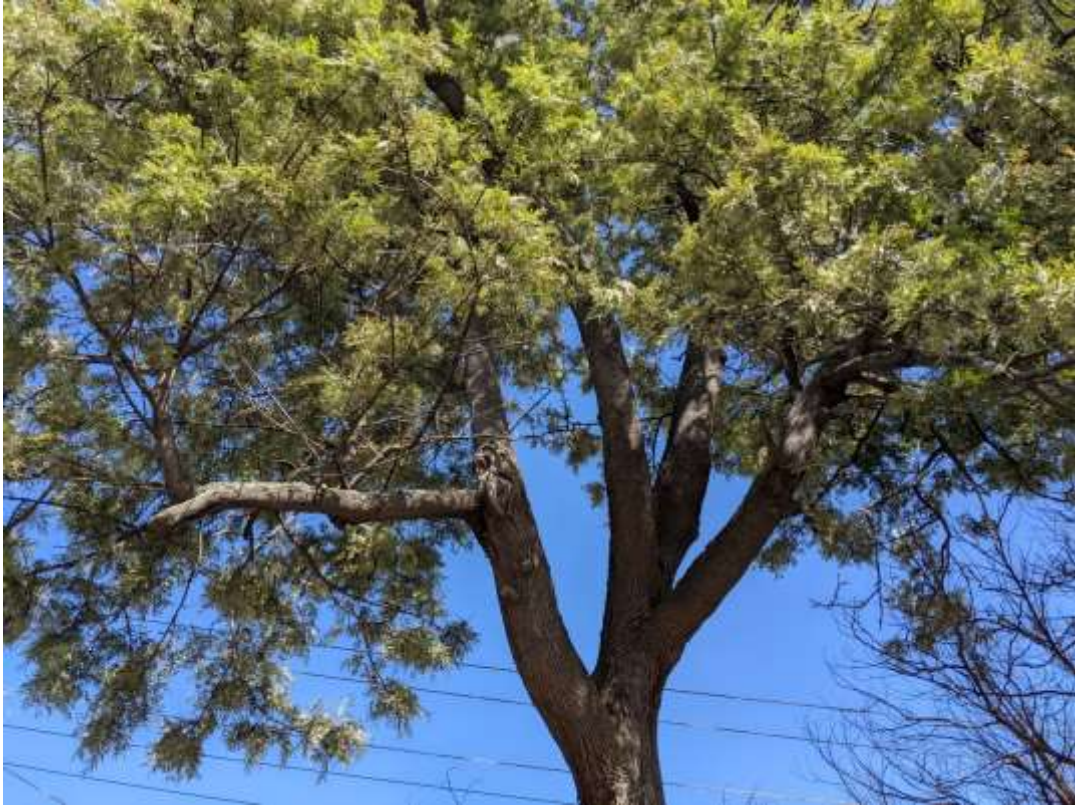
Photograph 7 – Tree 3