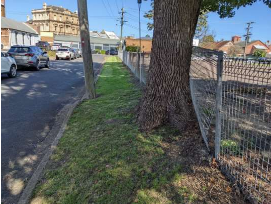
Photograph 3 – Tree 2