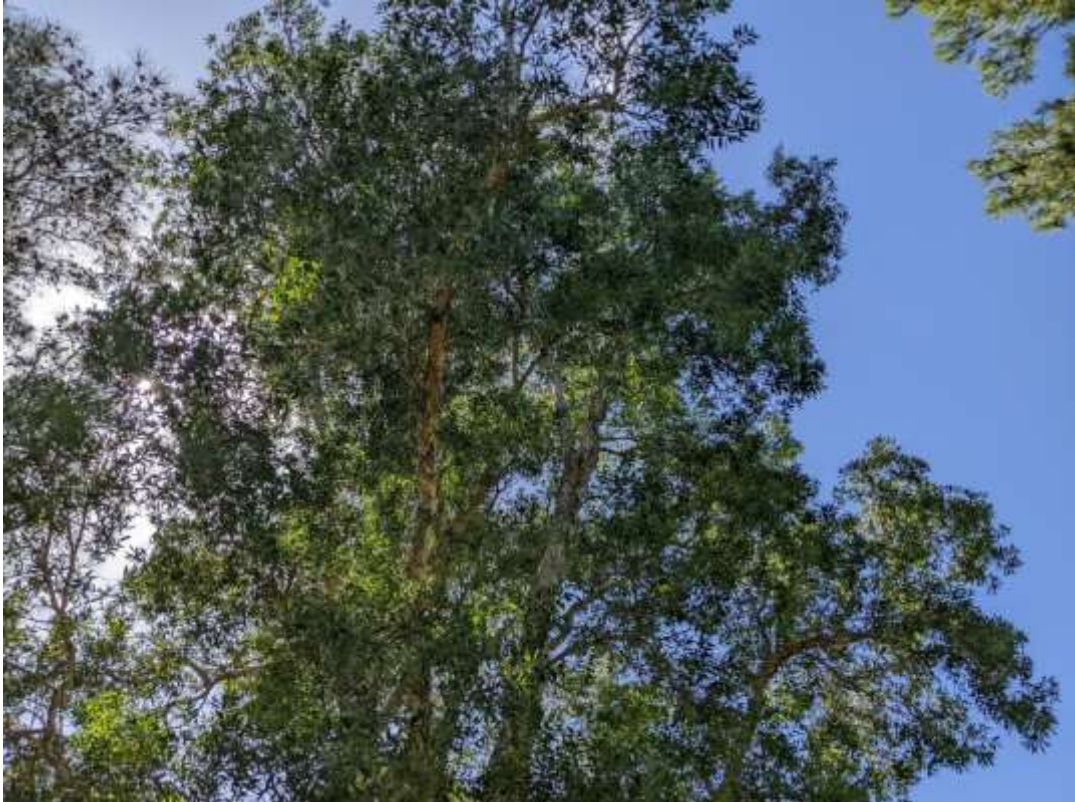
Photograph 24 – Tree 12