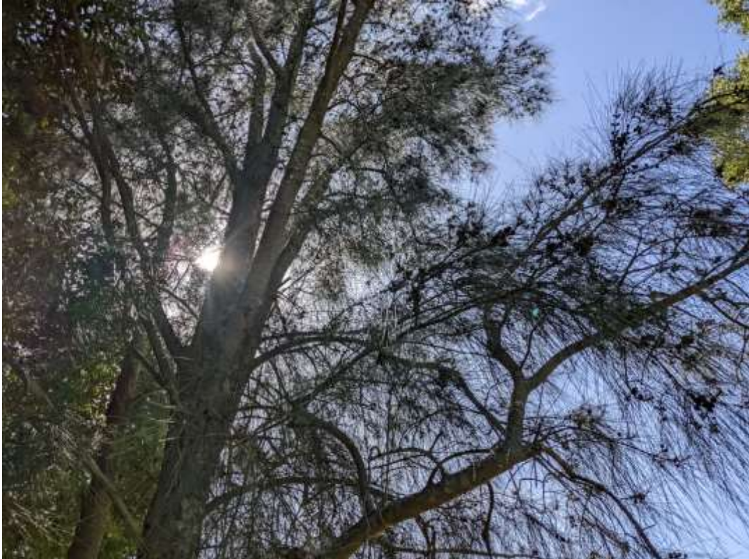
Photograph 26 – Tree 13