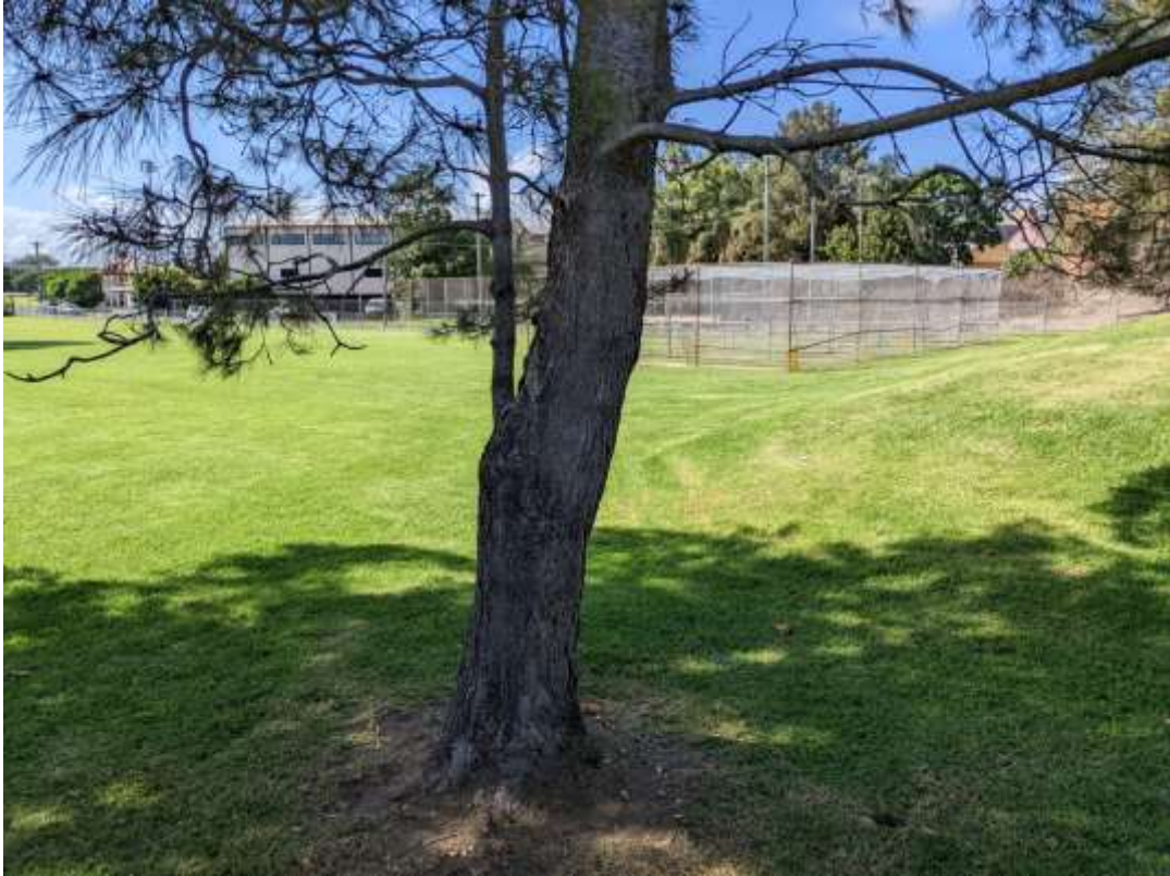
Photograph 21 – Tree 11