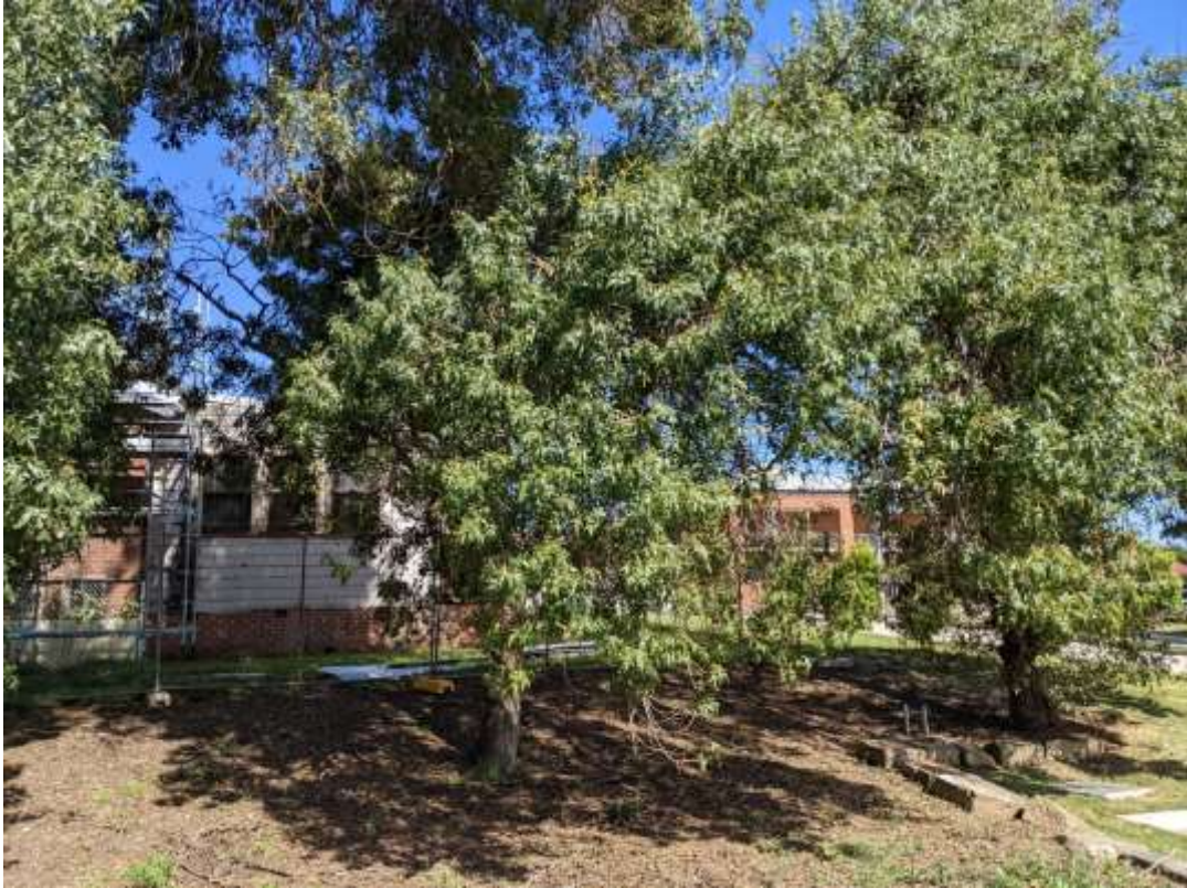
Photograph 17 – Tree 8 (centre) and Tree 9 (right)