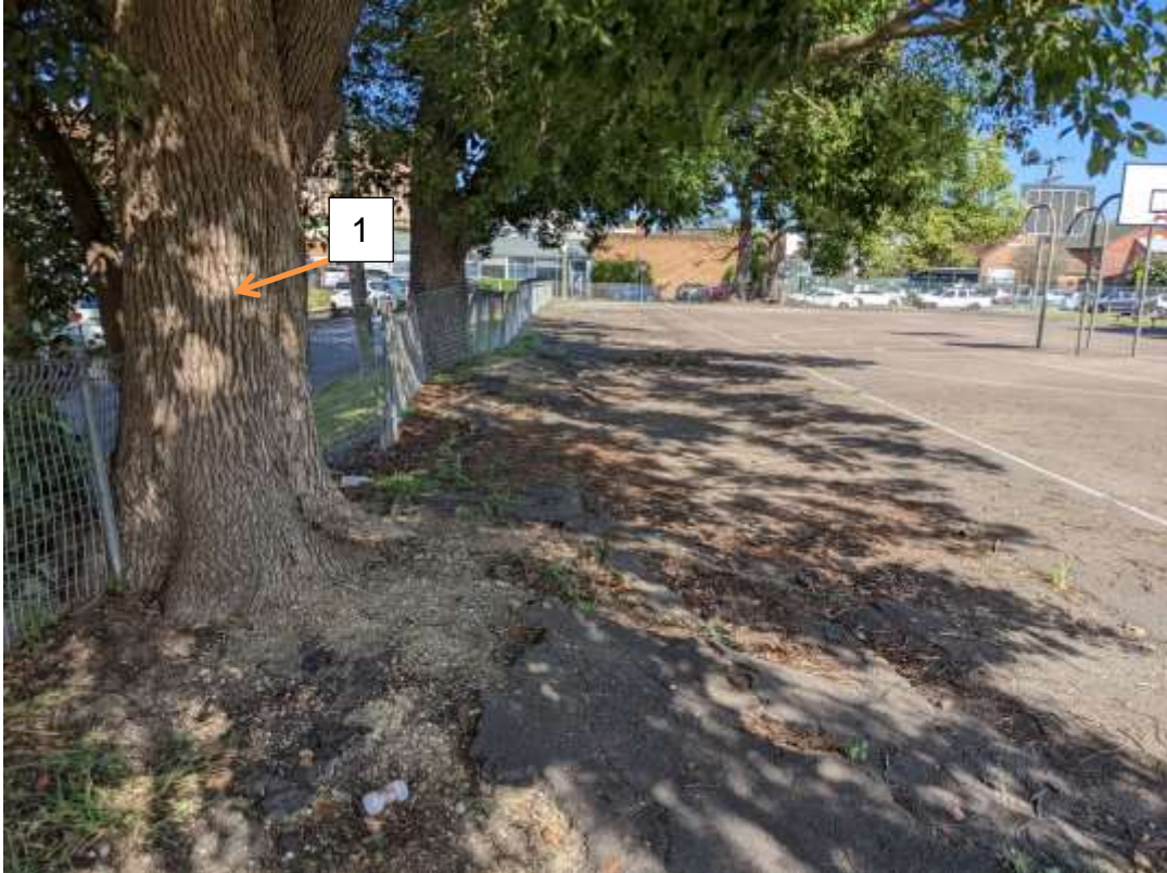
Photograph 5 – Trees 1 and 2 and damage to asphalt