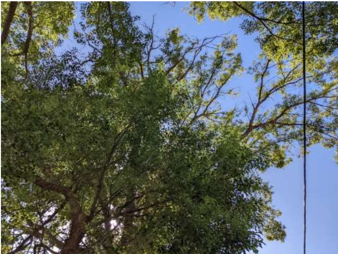
Photograph 2 – Trees 1