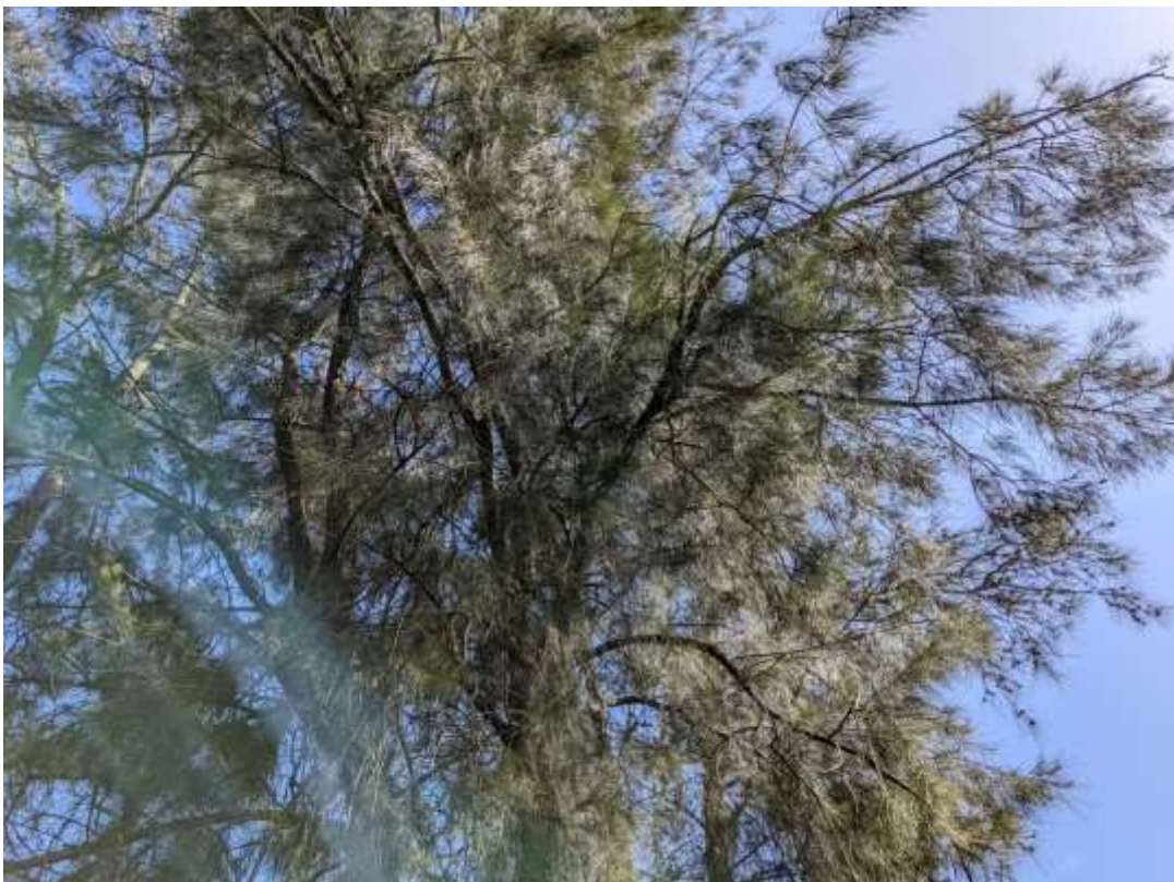
Photograph 34 – Tree 19