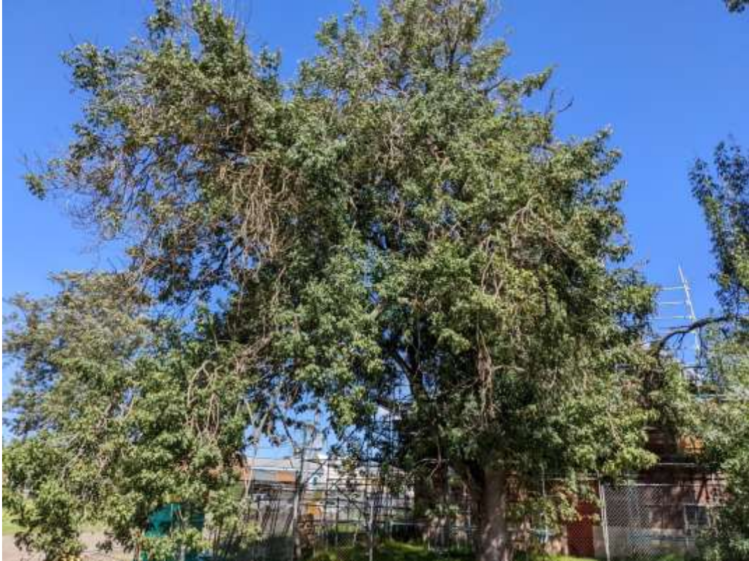
Photograph 15 – Tree 6