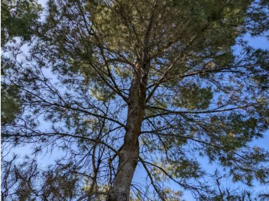
Photograph 22 – Tree 11