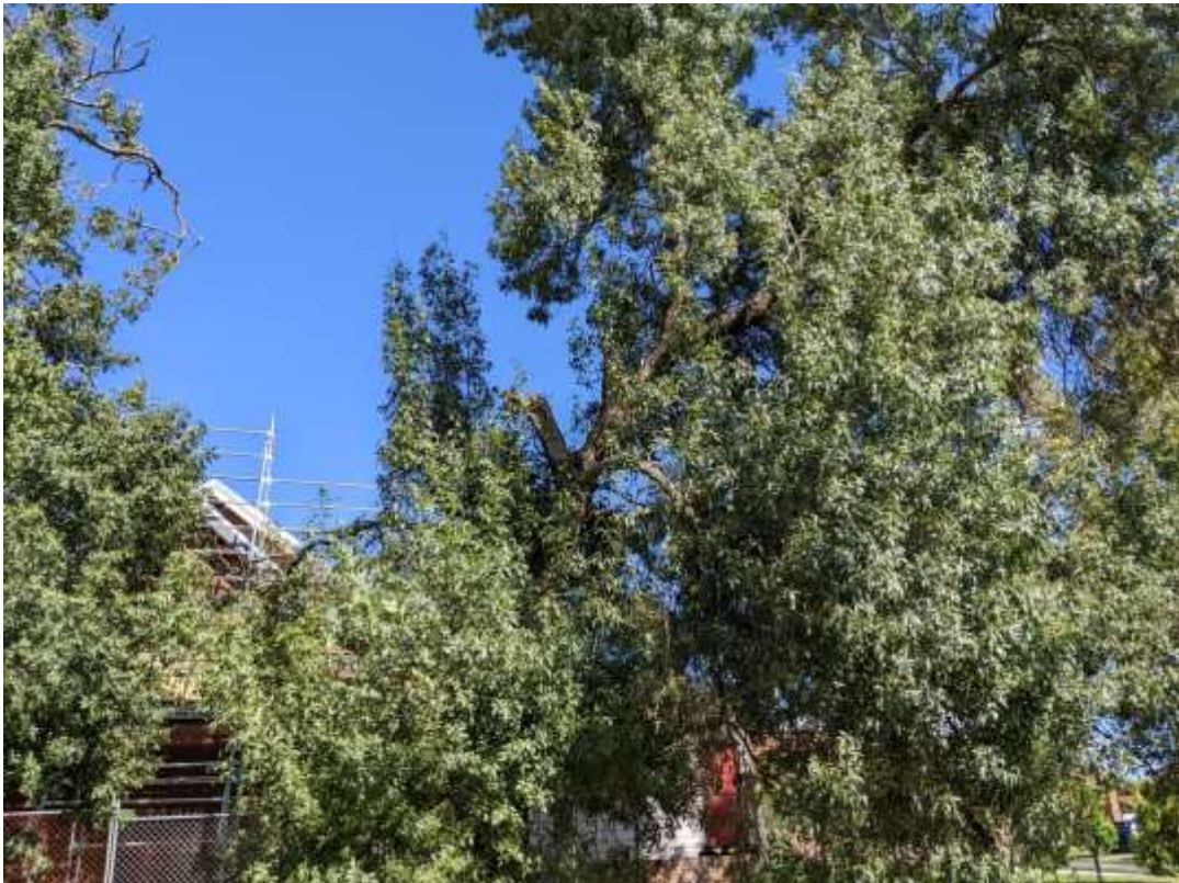
Photograph 16 – Tree 7