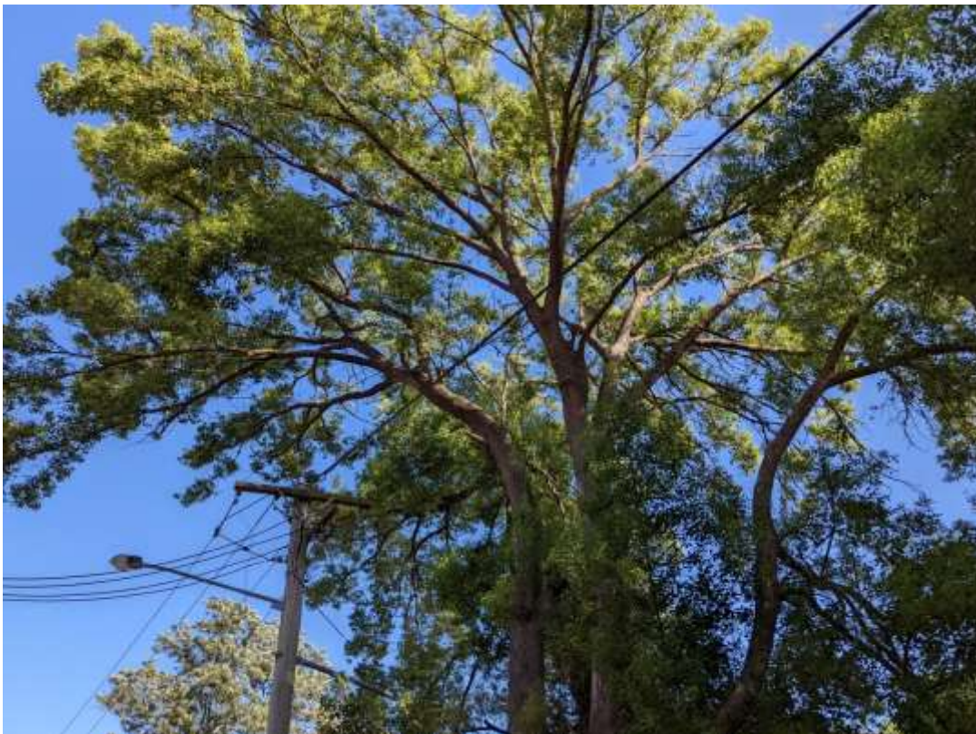
Photograph 4 – Tree 2