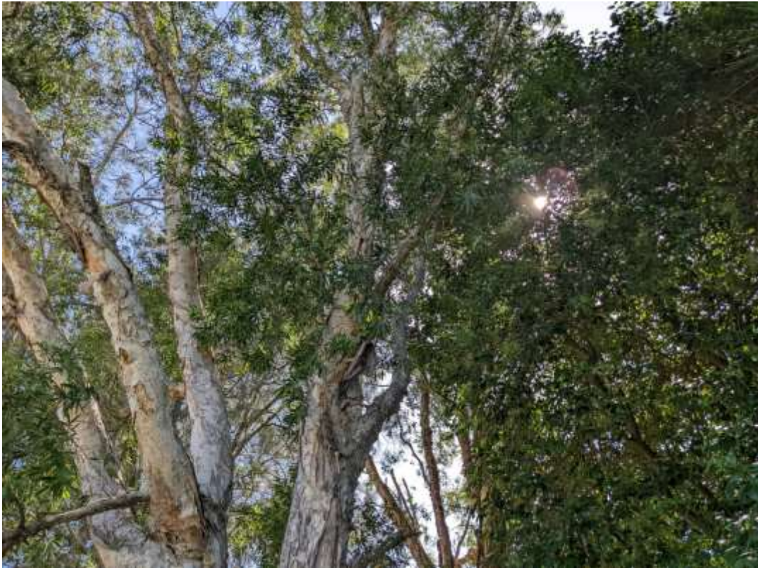
Photograph 31 – Tree 16