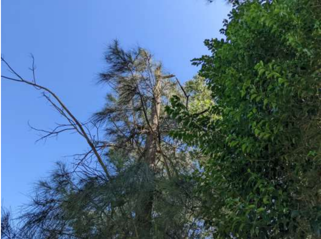
Photograph 28 – Tree 14