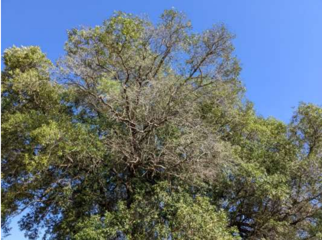
Photograph 12 – Tree 5