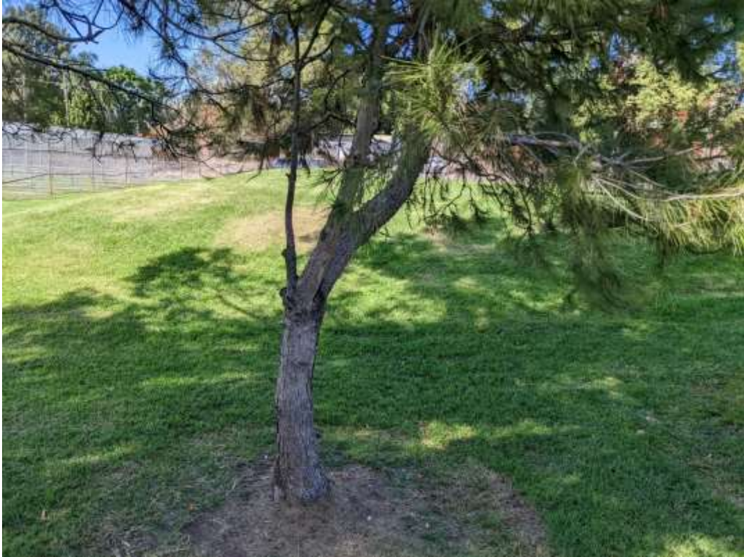
Photograph 19 – Tree 10