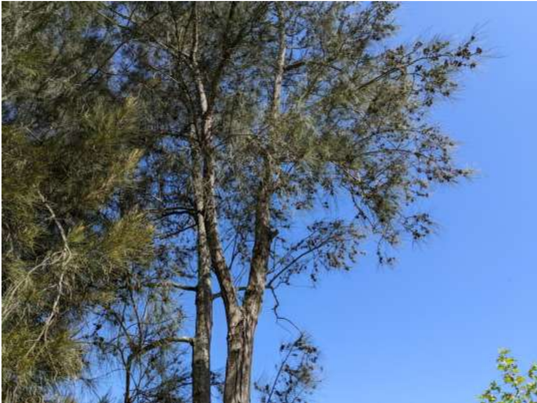
Photograph 36 – Tree 20