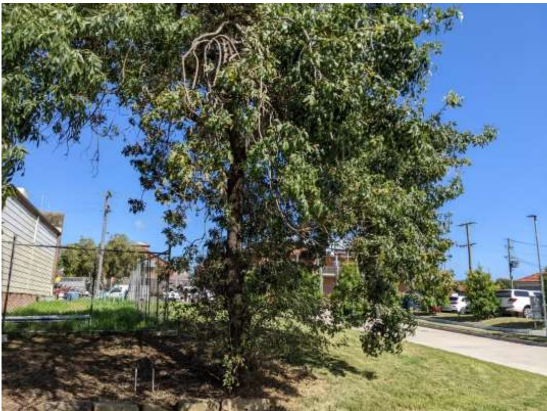
Photograph 18 – Tree 9