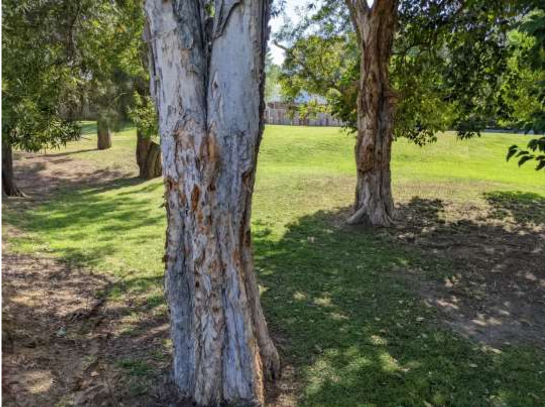
Photograph 30 – Tree 16 (centre) and Tree 17 (right)