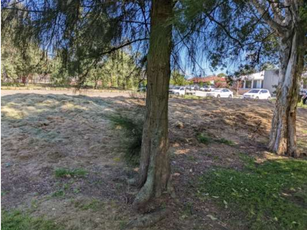
Photograph 27 – Tree 14