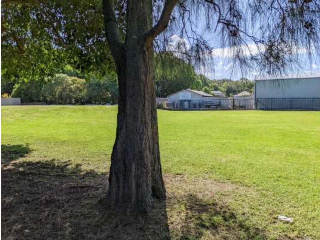
Photograph 25 – Tree 13