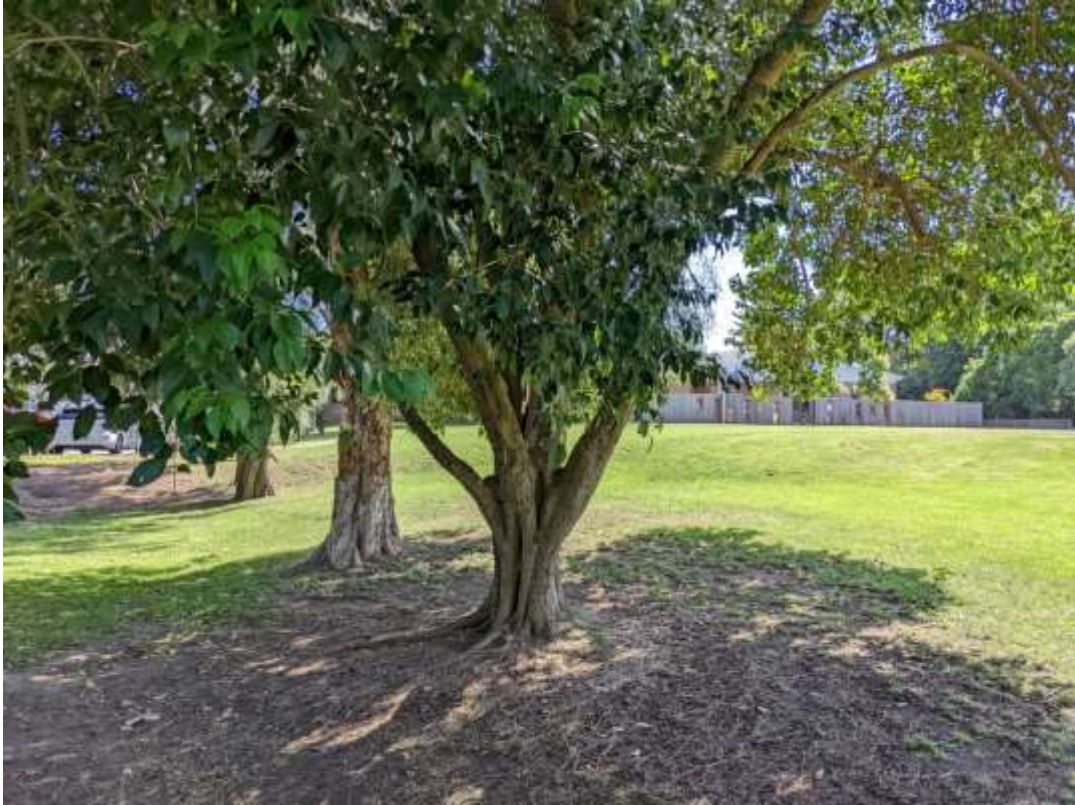
Photograph 29 – Tree 15