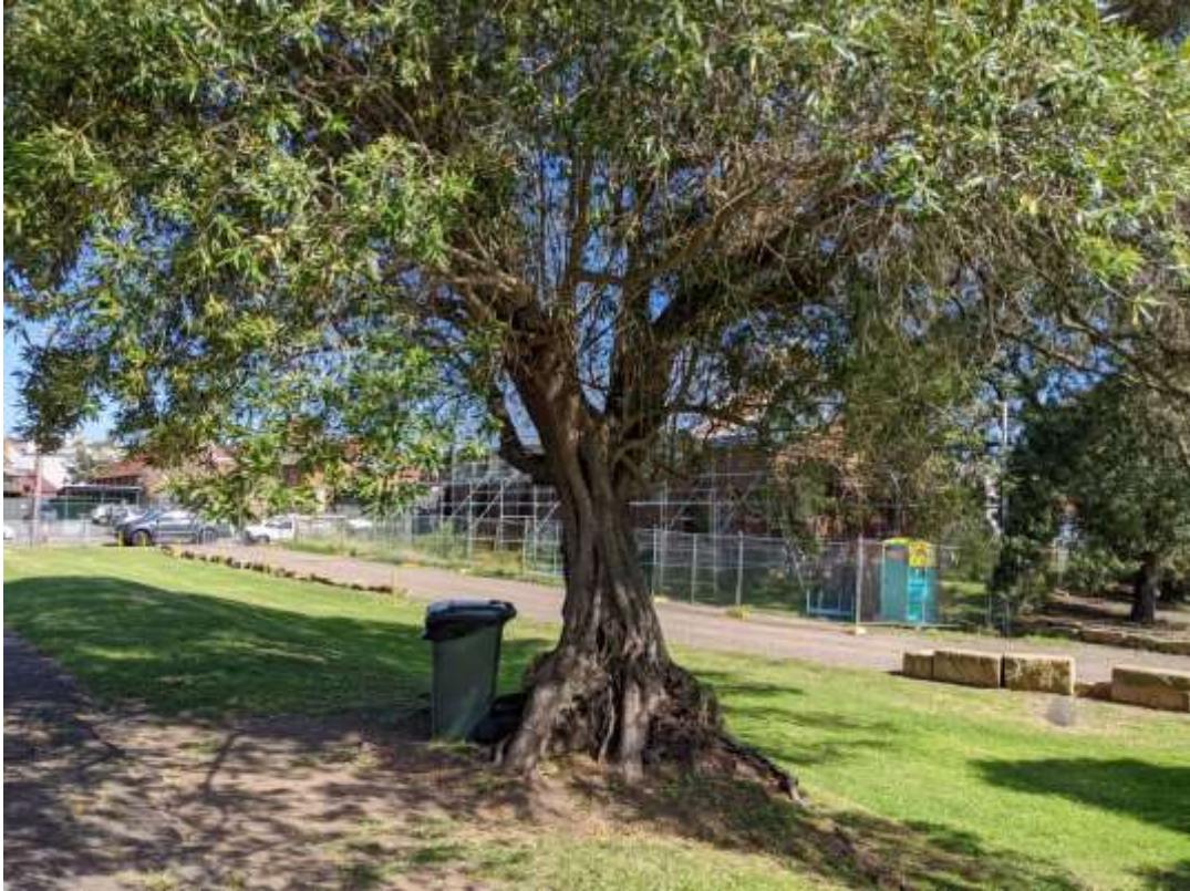
Photograph 11 – Tree 5