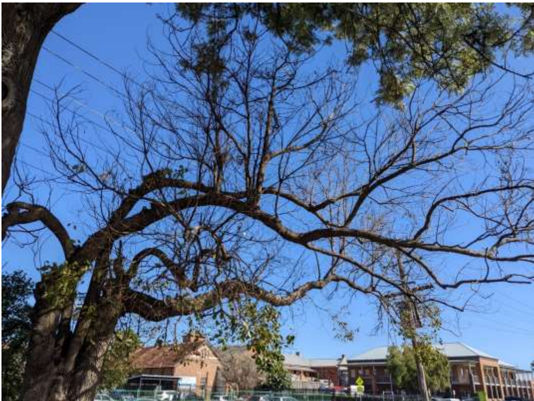
Photograph 8 – Tree 4