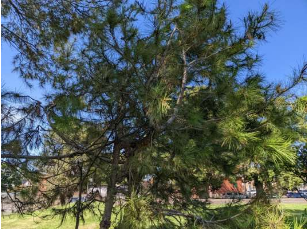
Photograph 20 – Tree 10