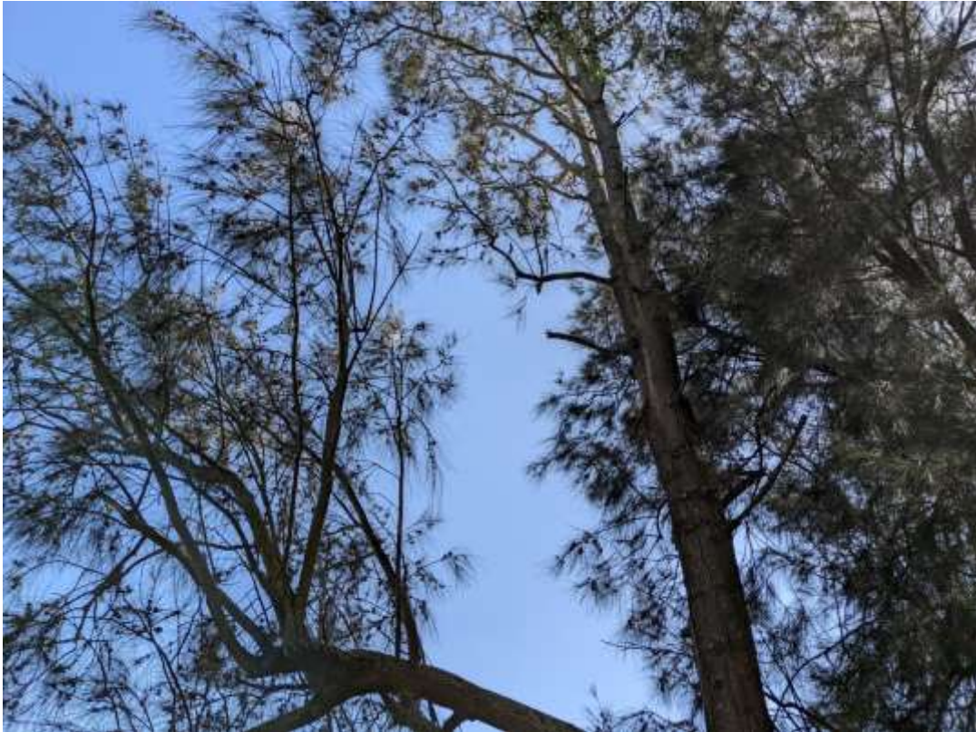
Photograph 33 – Tree 18