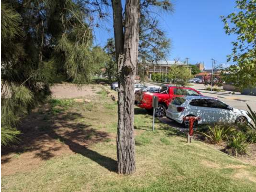
Photograph 35 – Tree 20