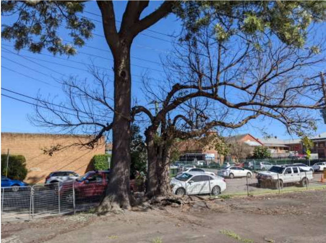
Photograph 6 – Trees 3 (left) and 4 (right)