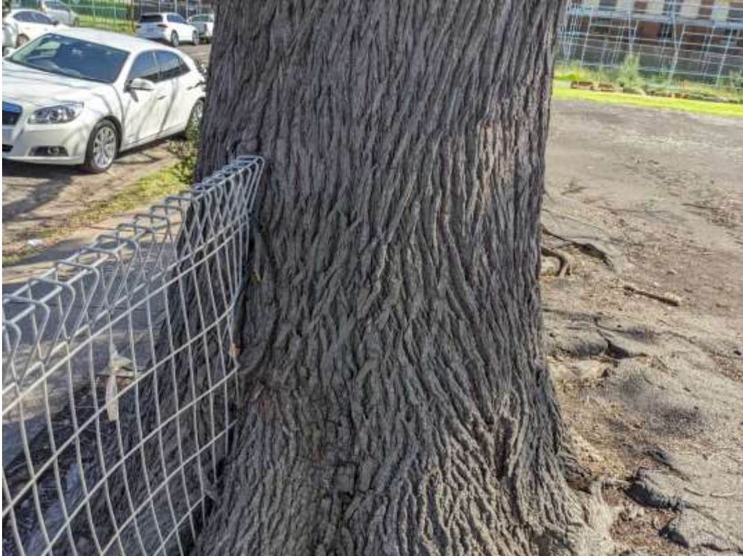
Photograph 9 – Tree 3