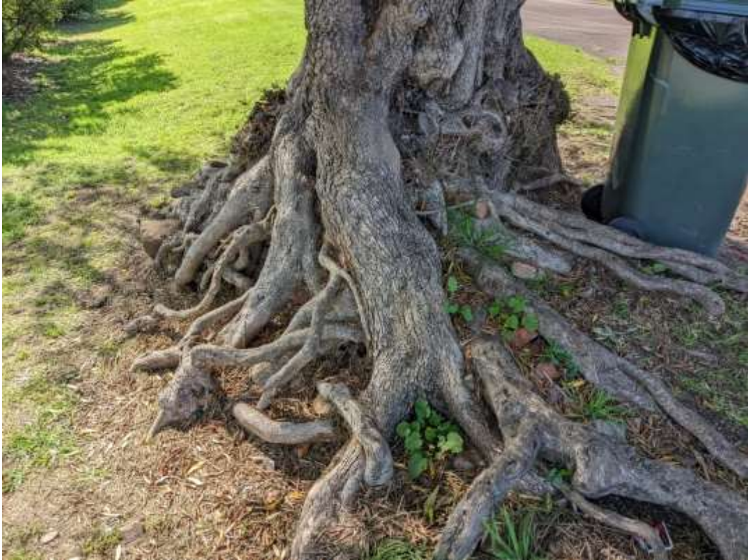
Photograph 13 – Tree 5