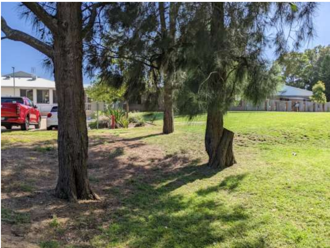
Photograph 32 – Trees 18 (left), 19 (right), 20 (centre at rear)