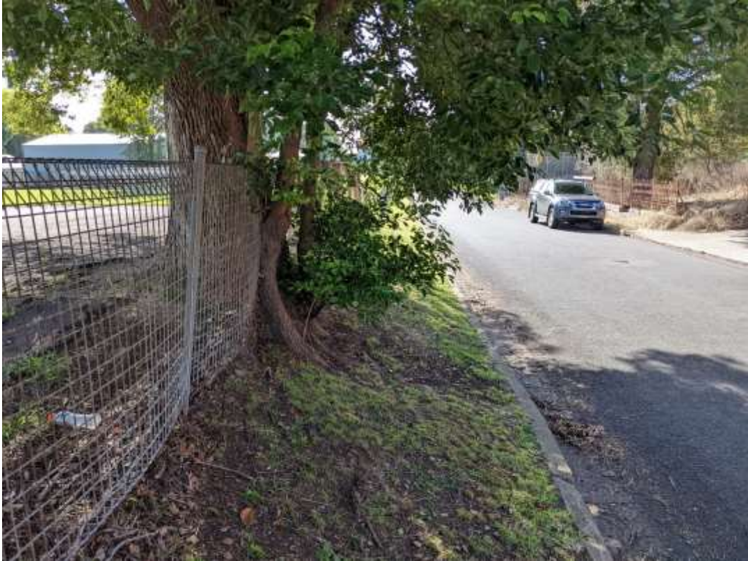
Photograph 1 – Tree 1