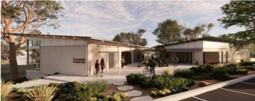
Figure 1 | Proposed Development

The Tenambit Community Centre is designed over a single level and provided two (2) pavilions with a central landscaped courtyard. Facilities include multipurpose rooms, meeting room and tenancy with associated sanitary facilities.