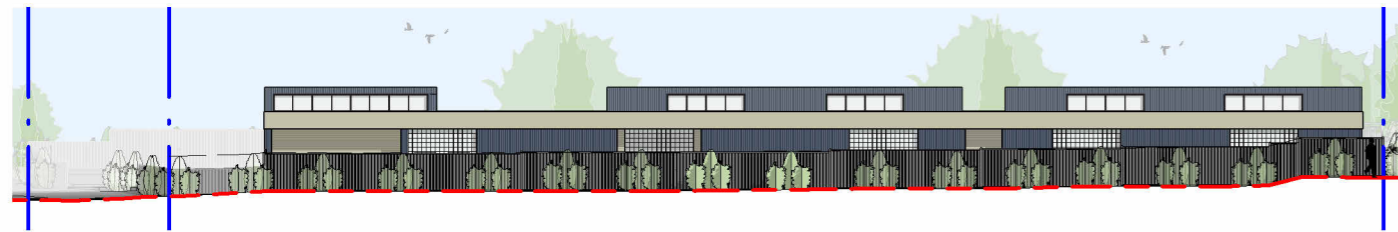
2 NORTHERN ELEVATION 1:350