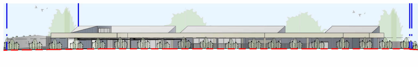
3 SOUTHERN ELEVATION 1:350