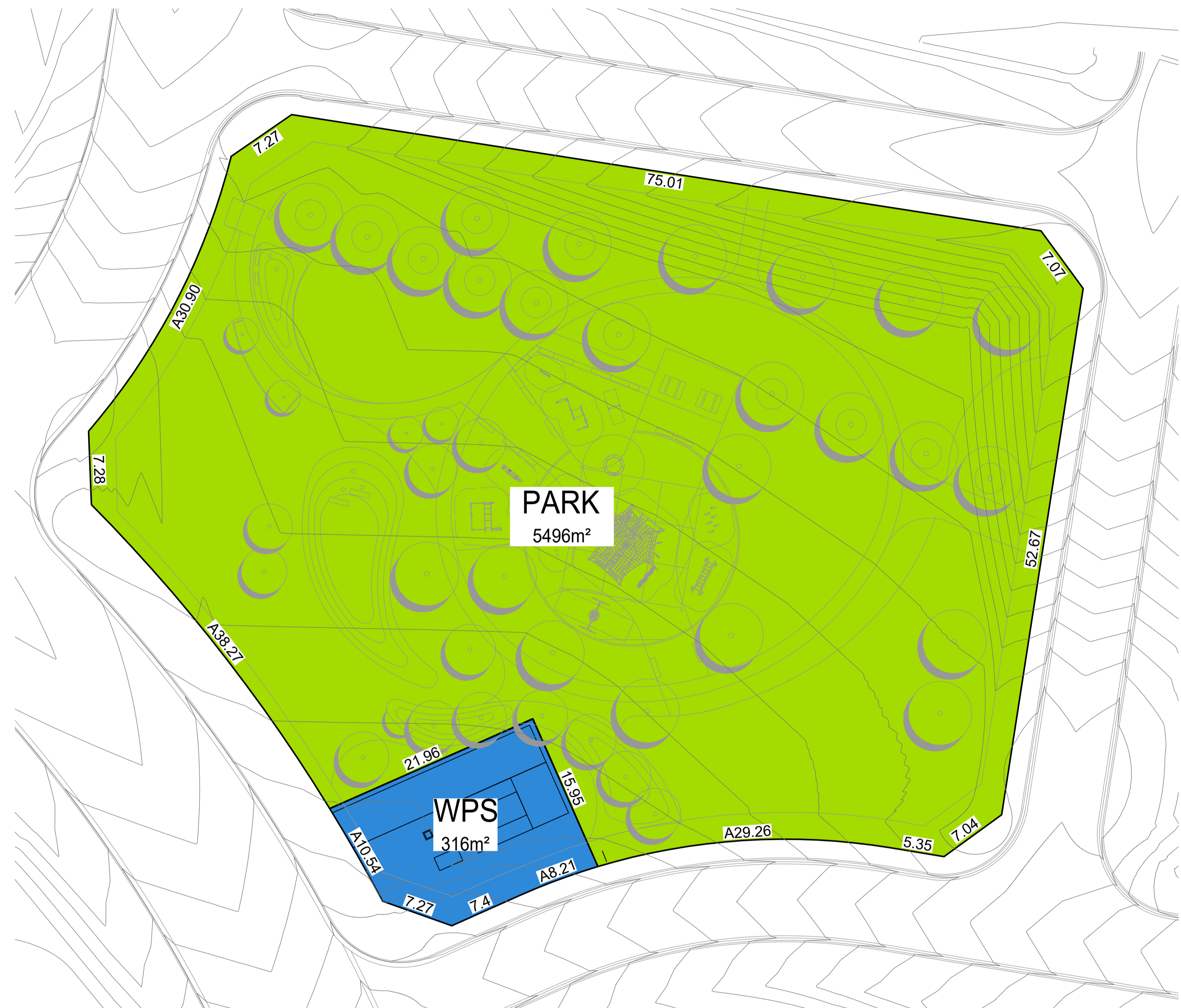
WATER BOOSTER PUMP STATION & PARK INTEGRATION DETAIL SCALE 1:500