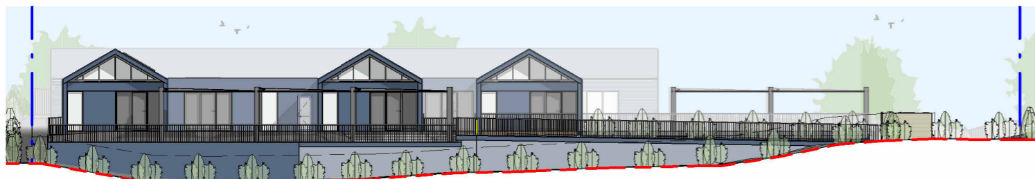
3 SOUTHERN ELEVATION 1 : 350