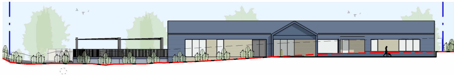
2 NORTHERN ELEVATION 1 : 350