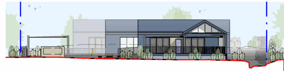
4 EASTERN ELEVATION 1 : 350