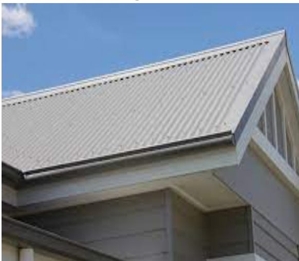
ROOF COLOUR AND MATERIALS

The roof will be a traditional zinc - keeping in line with the heritage and style of existing central Maitland homes. The colour palette chosen for the proposed dwelling and fence will be Dulux Antique White which is clean, modest and compliments the existing homes in the surrounding area.