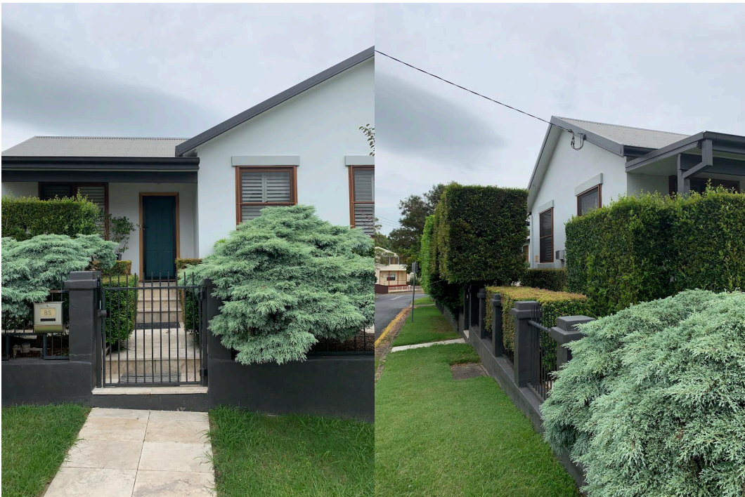
Corner of Nicolson Street and Elgin St Maitland No 85

The proposed dwelling 65 Lee Street Maitland will be constructed using brick or besser blocks on the ground level and weather boards on the upper level, all painted antique white in colour.