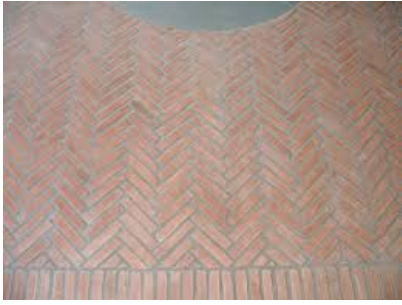
Pathway at front of proposed dwelling and garage entrance strips (brick paved herringbone)

After researching homes in the central Maitland precinct this understated colour palate adds a complementary feel to already existing heritage homes and new builds in the surrounding streets and neighbouring areas.