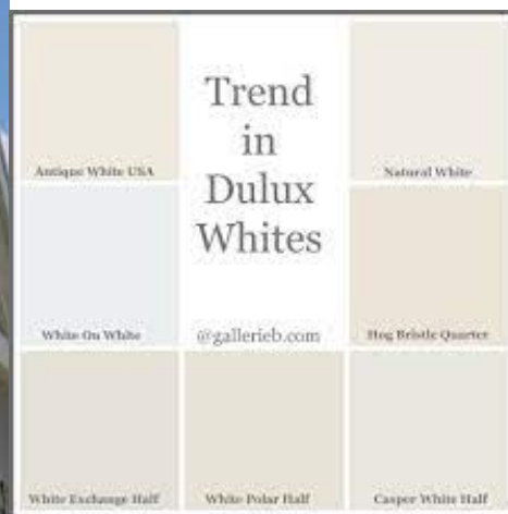
WHITE COLOUR PALET