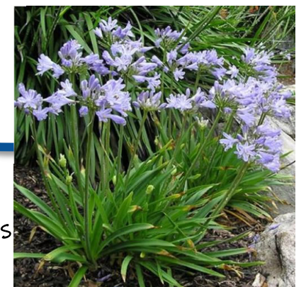
agapanthus orientalis 140mm pot size