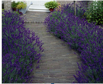
Blue English Lavender 200mm Pot Size