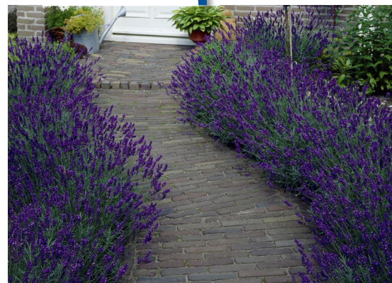
Blue English Lavender 200mm Pot Size