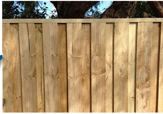
Lapped and Capped timber fence 1.8m. Fence lowered to 1.2m to boundary forward of building line