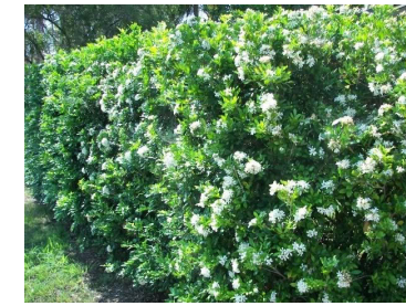
Hedge and front fence Orange Jasmine spaced 850- 1000mm centres 200mm pot size planted behind rural style fence