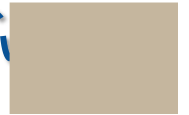
Morpeth Mix Papyrus path- way to front door and gate