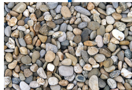
Small to medium landscaped river stones