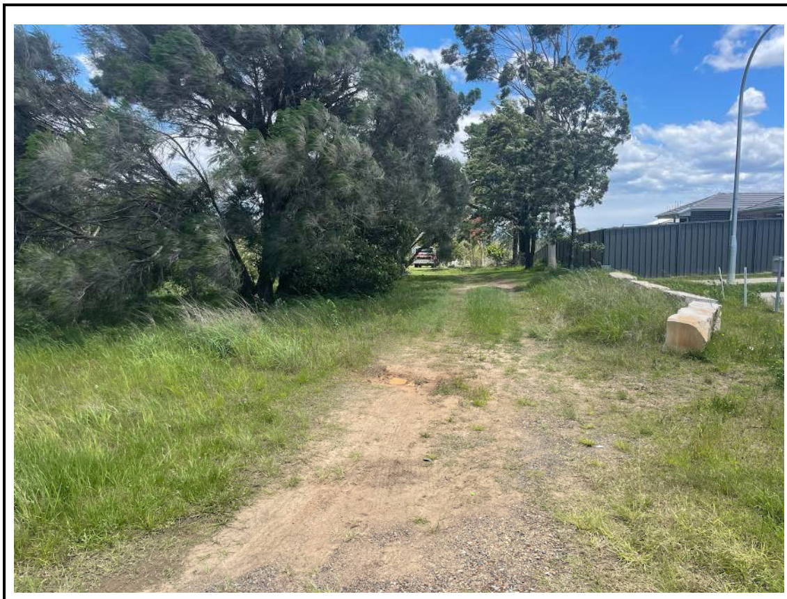
The Site at 175 Wollombi Road Farley NSW 2320