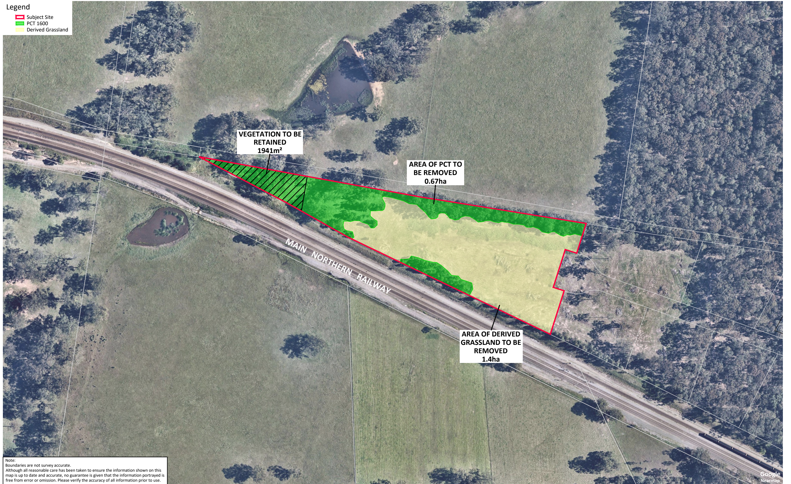
FIGURE 3 - 1: VEGETATION MAP

CLIENT Client SITE DETAILS Lot 206 Gardiner Street Rutherford DATE 22 March 2022