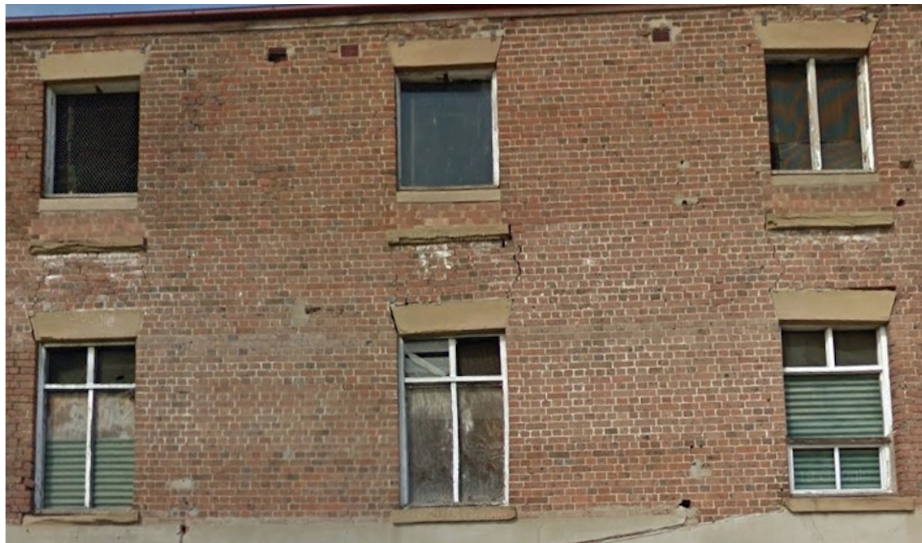
PHOTO of north facing wall of the existing Bond Store Sandstone lintels and sills to be removed, stored and reused in the interpretive panels