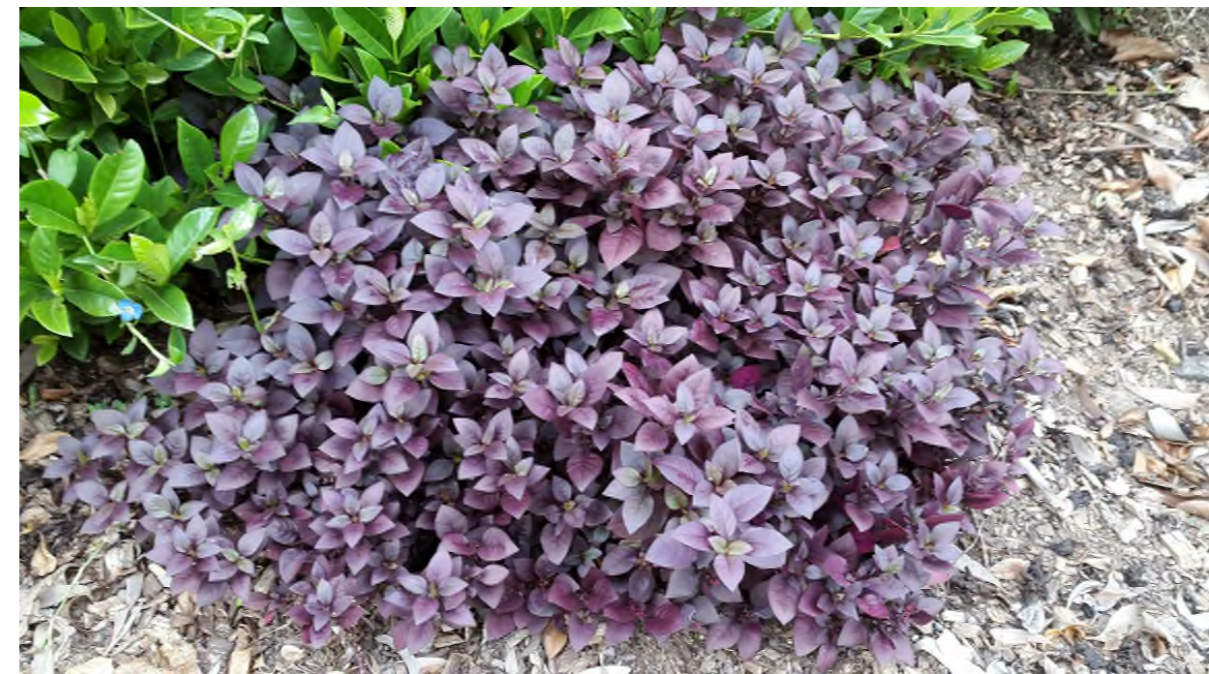
Little Ruby 1:10