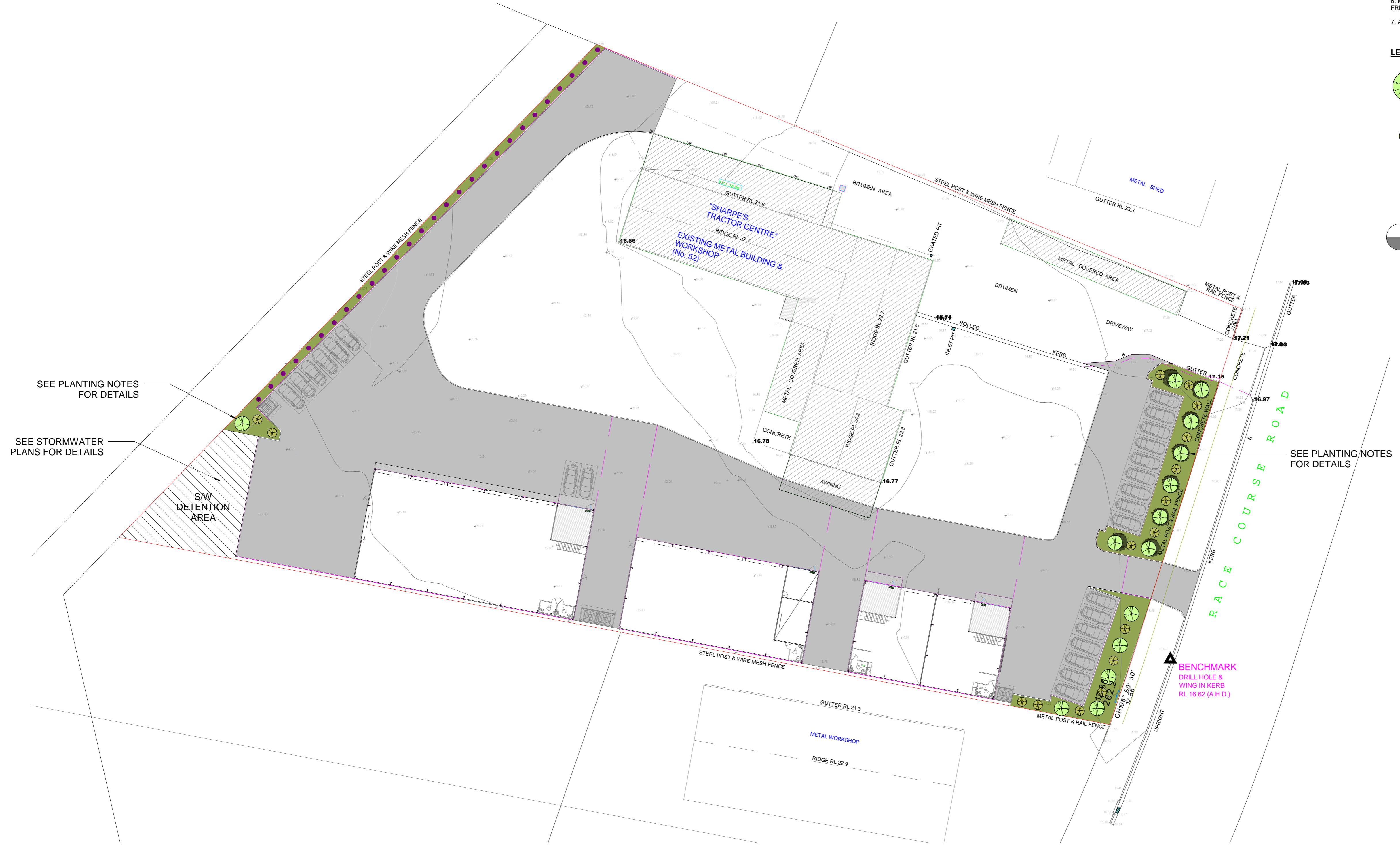
Planting Schedule 1:100

1 AMENDED AS PER COUNCIL REQUEST 29.11.2021