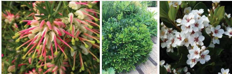
GREVILLEA HILLS JUBILEE