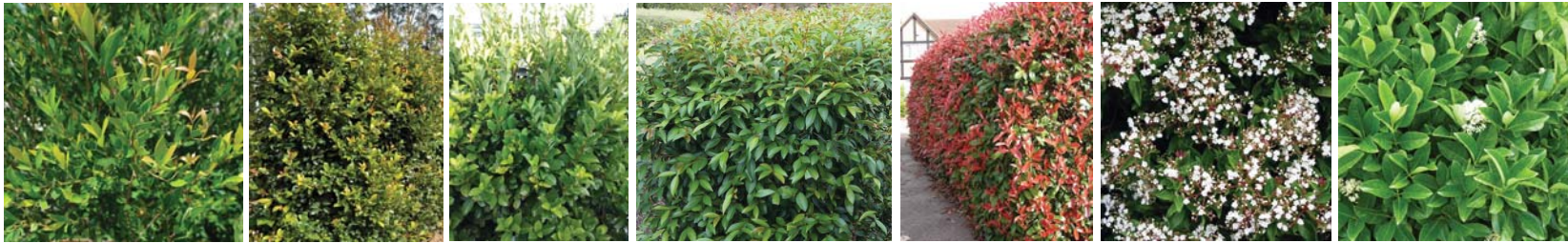
ACMENA SMITHII MINOR