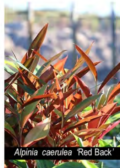
Alpinia caerulea 'Red Back'