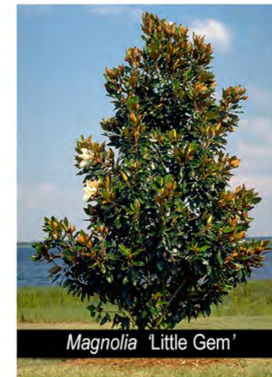
Magnolia 'Little Gem'