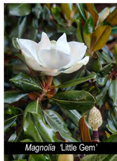
Magnolia 'Little Gem'