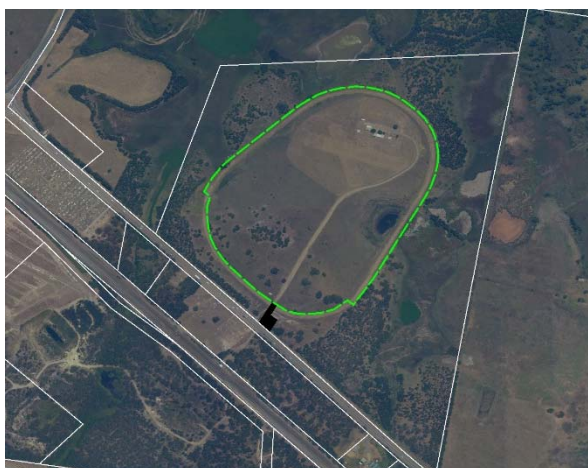
Area Licenced to Aeromodellers

Written submissions relating to this lease proposal are to be made no later than 5pm Monday 15 June 2020 to Council by: