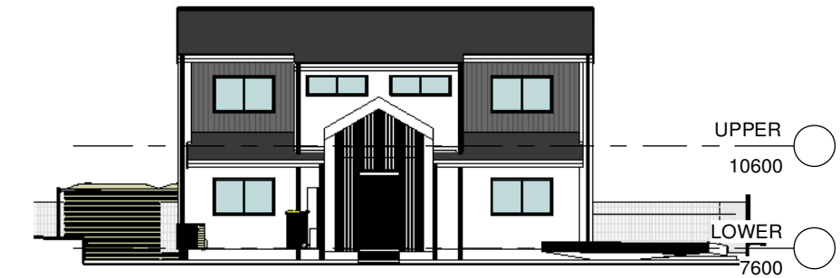
3 NORTH WEST ELEVATION Copy 1 A800 1 : 200