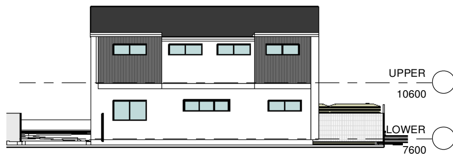
4 SOUTH EAST ELEVATION Copy 1 A800 1 : 200