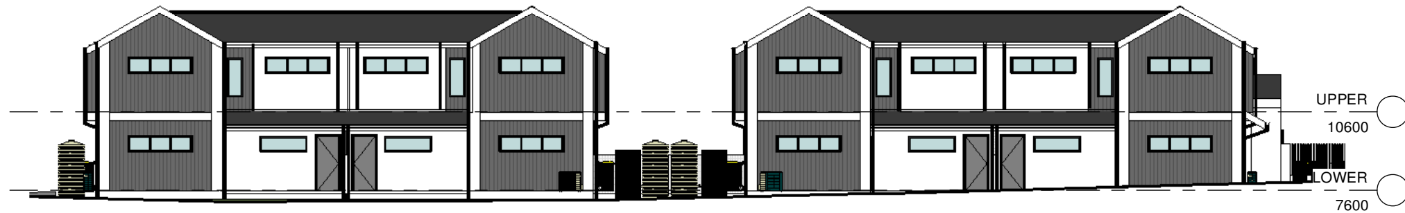
2 NORTH EAST ELEVATION Copy 1 A800 1 : 200