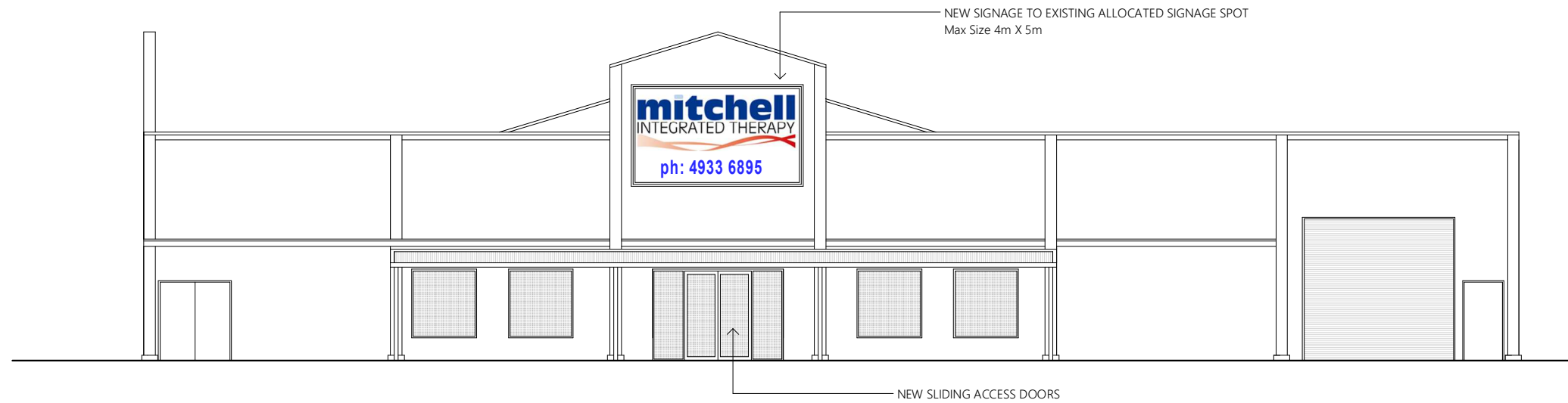
01 ELEVATION - West SIGNAGE PLAN