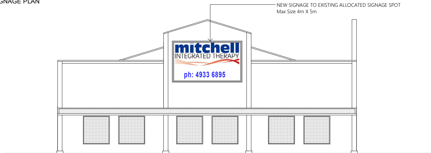
01 ELEVATION - North SIGNAGE PLAN