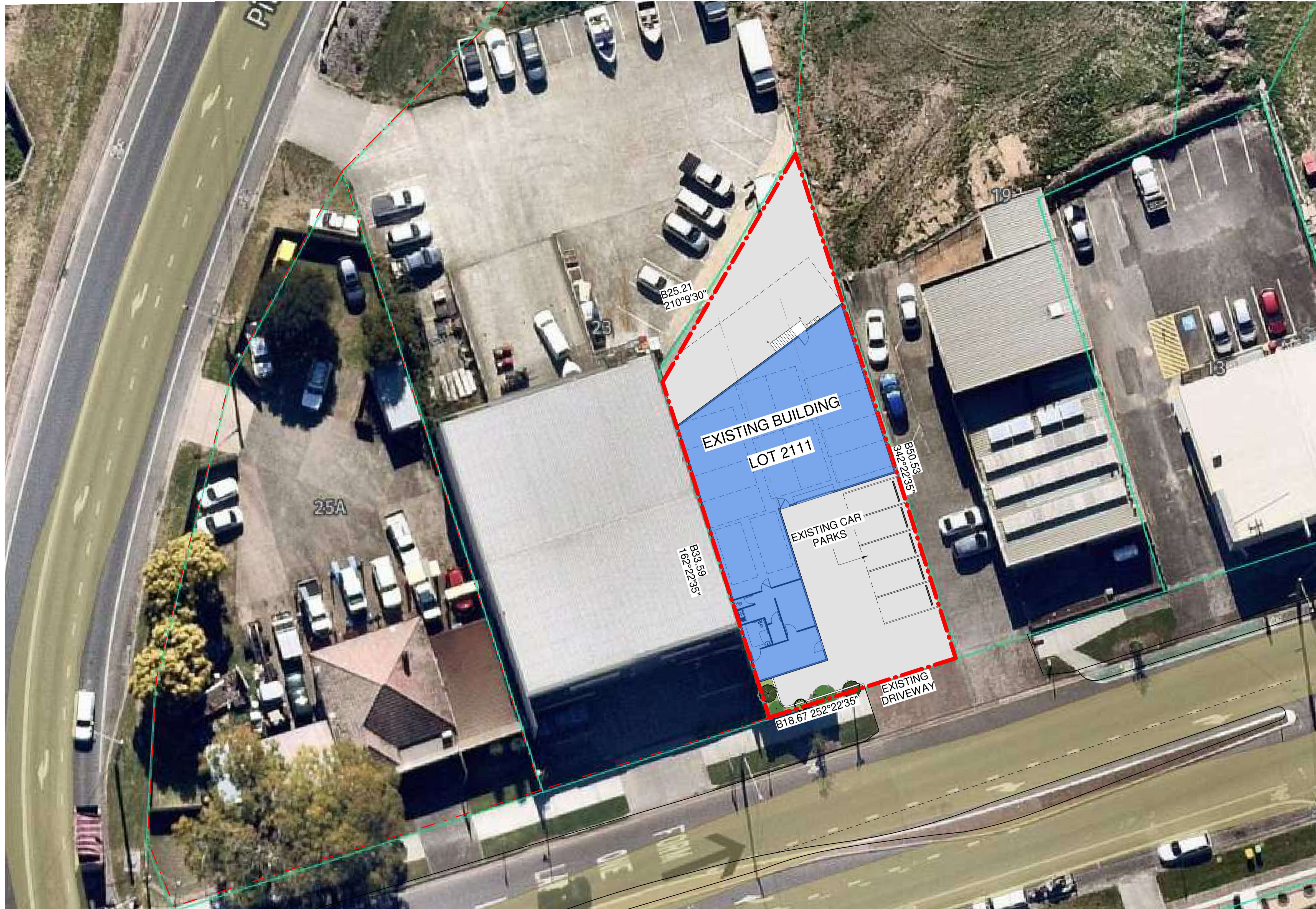
1 Site- Overall 1 : 200