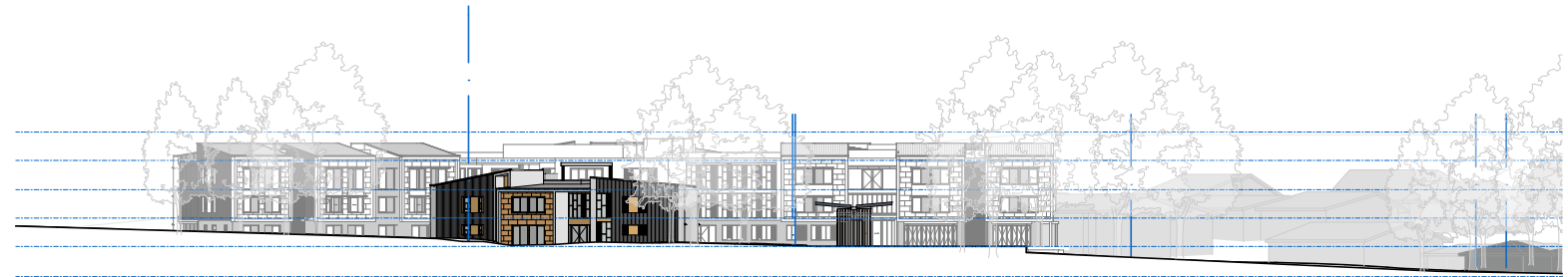
02 EAST ELEVATION SCALE: 1:600