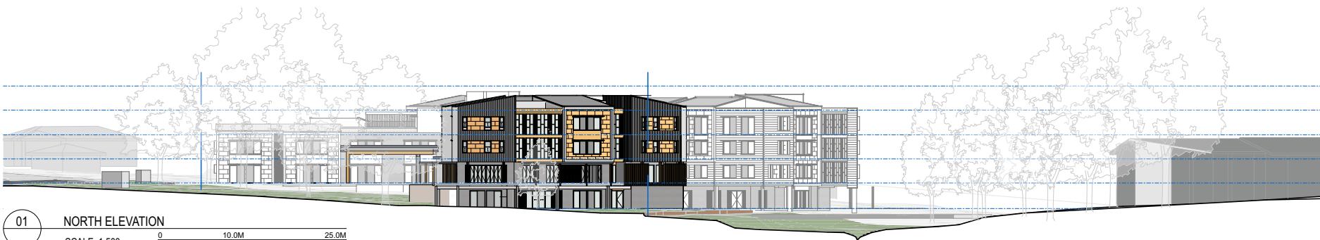
01 NORTH ELEVATION SCALE: 1:500