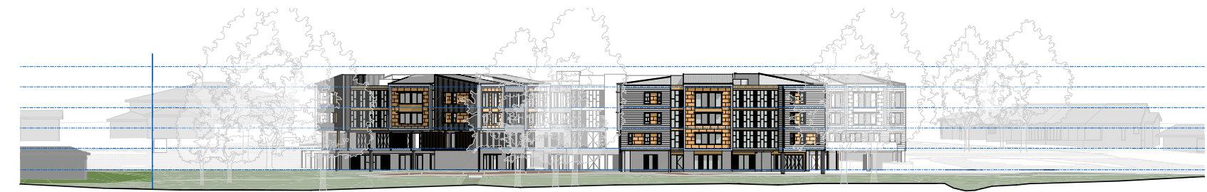
04 WEST ELEVATION SCALE: 1:600