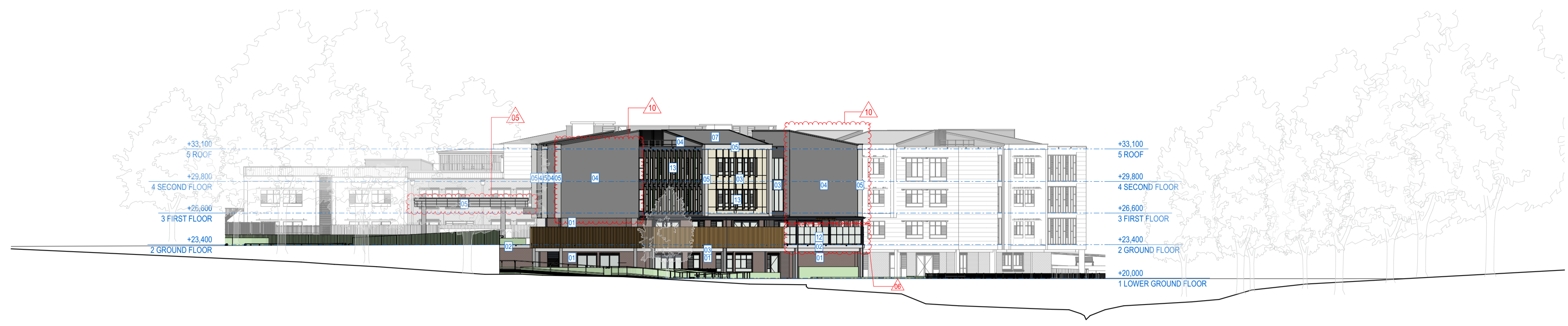
E/01 NORTH ELEVATION SCALE: 1:300