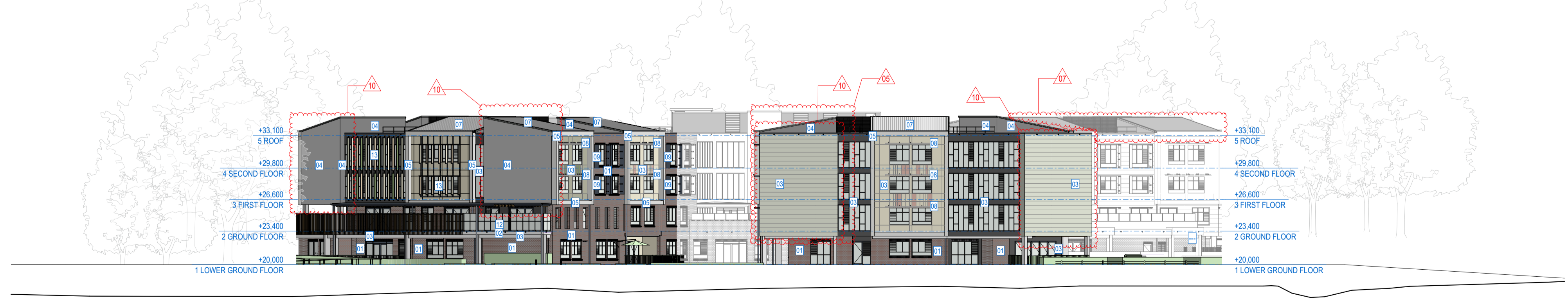
E/04 WEST ELEVATION SCALE: 1:300