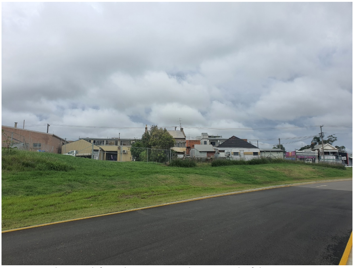
Image 50 Looking south from the Sportsground access north of the Site