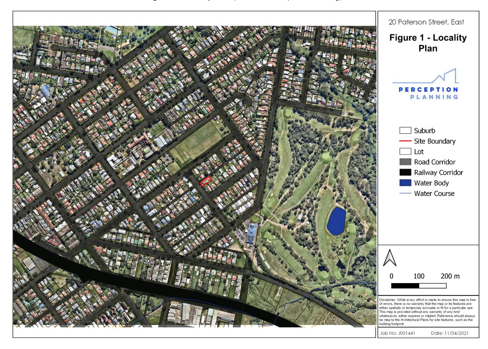
Figure 1 - Locality Plan