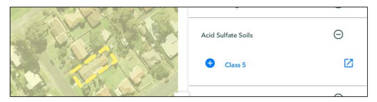
Figure 3 – Acid Sulfate Soils Class 5

The objective of Clause 7.1 is to ensure that development does not disturb, expose, or drain acid sulfate soils and cause environmental damage. The site is identified to be affected by Class 5 Acid Sulfate Soils (ASS), as can be seen in the NSW Planning Portal Image below. The minor soil disturbance required for the site preparations and levelling is not expected to exceed 1m in depth or lower the water table, as such will not disturb acid sulfate soils.