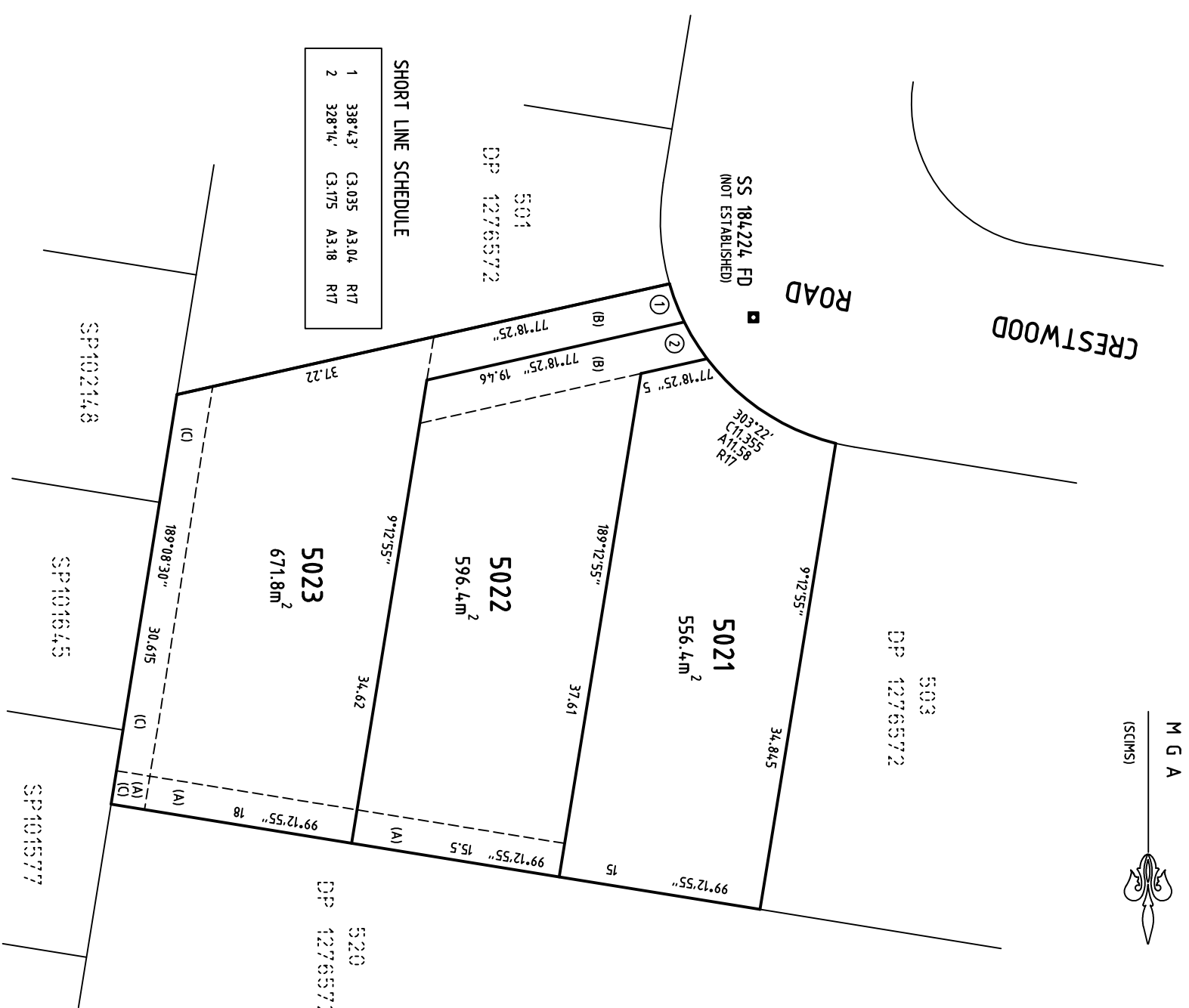
DIAGRAM A R.R.: 1:300